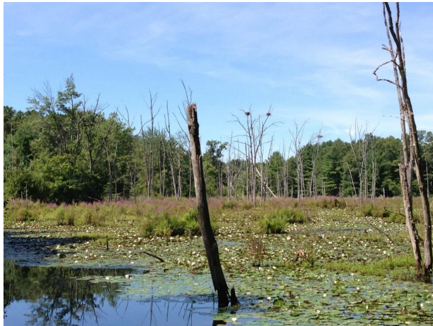
Billerica Beaver Created Heron Rookery

The use of flow devices at 43 sites in town has prevented the trapping of 38 beaver colonies. In Billerica these 38 beaver colonies create an average of 10 wetland acres with their dams, or 380 total wetland acres that would not exist if the beavers were trapped. Estimates vary but ecological value of freshwater wetlands can conservatively be valued at over $5,000 per acre per year. 4 Therefore the untrapped beavers are providing the town with approximately $2,000,000 of free ecological services every year, and over 35 million dollars in ecological services since the inception of the program.