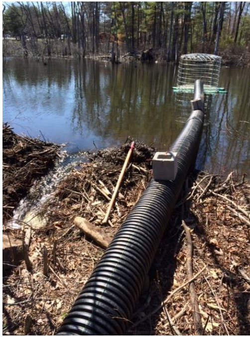
Pond Leveler Being Installed, Rangeway Rd.