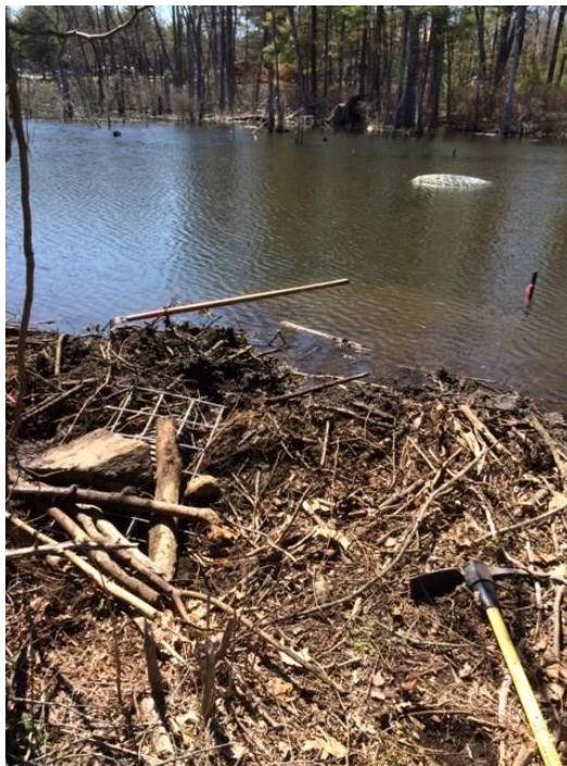
Pond Leveler in Beaver Dam, Rangeway Rd.