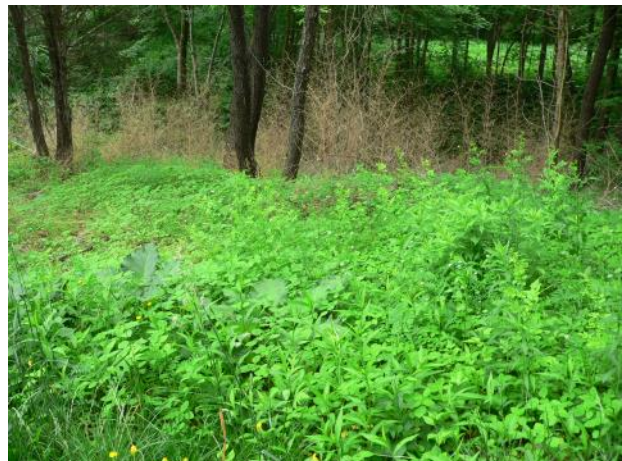
MRT study area in June 2014. All the green plants are herbaceous, most are native wildflowers. Some dead bamboo can be seen in the background.