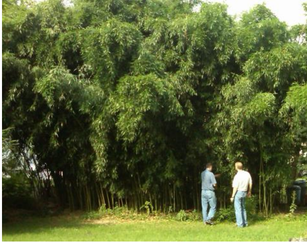
Figure 2. Uncontrolled running bamboo can become a nuisance when it grows into a neighbor's yard.

The Connecticut Invasive Plants Council determined that running bamboo did not meet the statutory criteria for inclusion on the invasive list because it has not moved from cultivated landscapes to natural areas. Although Phyllostachys has been grown in the United States since at least 1907, there have been no reports of it producing viable seed. Except for vegetative spread via rhizomes, it appears that all Phyllostachys in Connecticut originated from plantings or discarded culms. Because it is a sun demanding species, Phyllostachys has only been observed colonizing the very edge of undisturbed woods. In addition, the inability of the rhizomes to tolerate even seasonally wet soils means that streams and wetlands provide a barrier to its local expansion.