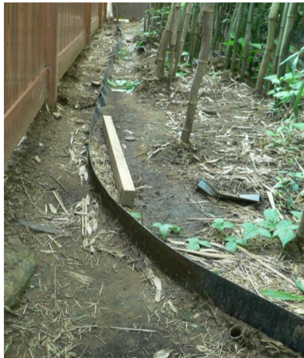
Figure 3. A properly installed root barrier can keep running bamboo where it is planted.

To keep Phyllostachys where it is appreciated and not wandering into the neighbor's yard, all plantings should be in aboveground containers or have a durable barrier that extends down at least 28 inches. It is important that the barrier be at a slight outward angle to encourage rhizomes to grow up towards the soil surface and that the barrier be a couple of inches aboveground to spot (and