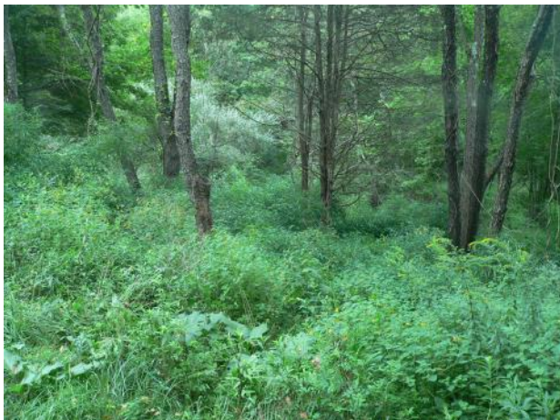
MRT study area in August 2013 prior to first herbicide treatment. Note that the new culms are much shorter and easier to treat.