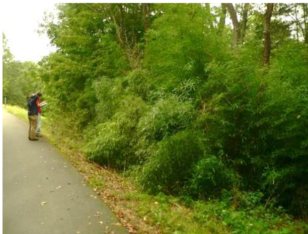
MRT study area in September 2012 prior to cutting dense infestation of running bamboo.